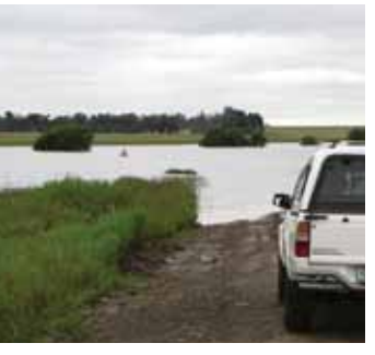
An "insurmountable obstacle" on MT03.