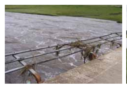
The power of water flattened these railings on MT01.

The bridge washaway that brought MT01 to an abrupt end.