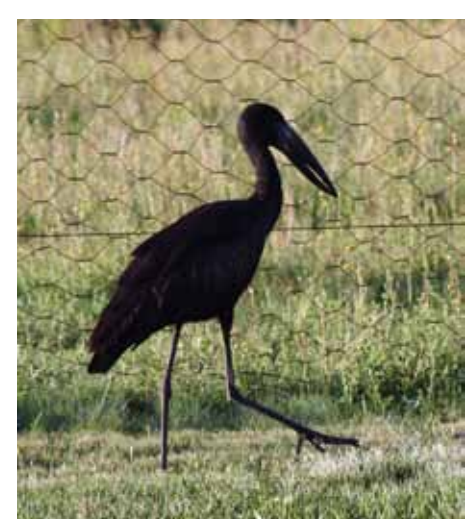
African Openbill in Barkley East.

Email was incredibly helpful this last count, as I could alert you to the irruption of African Openbills. Thank you so much for recording this species (CAR monitors all stork species) and please look out for it again during this winter count, as well as overwintering White Storks. Do read about this irruption in the interim website report. There is an article about