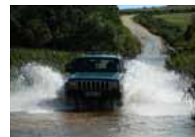
Crossing the Kromme River on EH06, after the water had subsided somewhat!