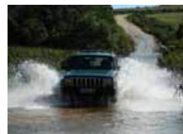
Crossing the Kromme River on EH06, after the water had subsided somewhat!