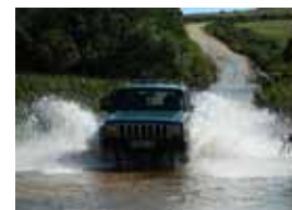
Crossing the Kromme River on EH06, after the water had subsided somewhat!