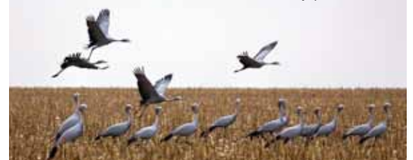
Blue Cranes enjoying mealie stubble on MT05.