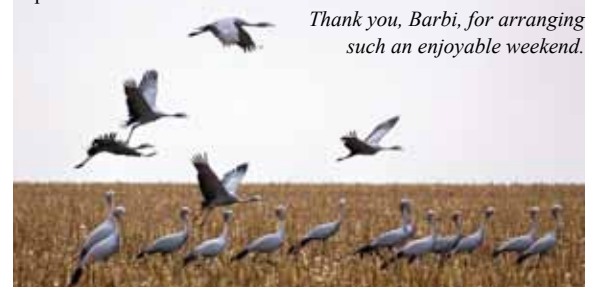
Blue Cranes enjoying mealie stubble on MT05.