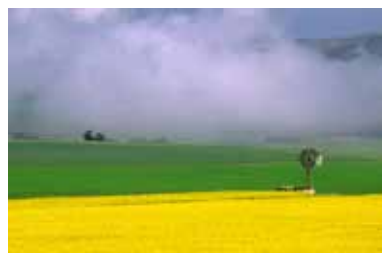
Beautiful contrasts of wheat and canola in the Overberg on a misty morning.

30 Overberg routes were captured and checked! Many thanks to Duncan and Inés for all the phoning, collection and acknowledgement of counts.