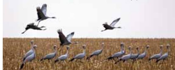
Blue Cranes enjoying mealie stubble on MT05.