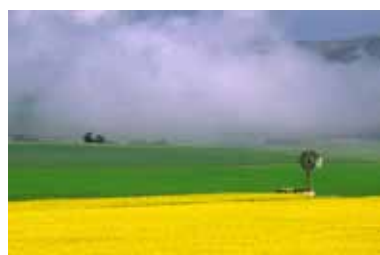
Beautiful contrasts of wheat and canola in the Overberg on a misty morning.